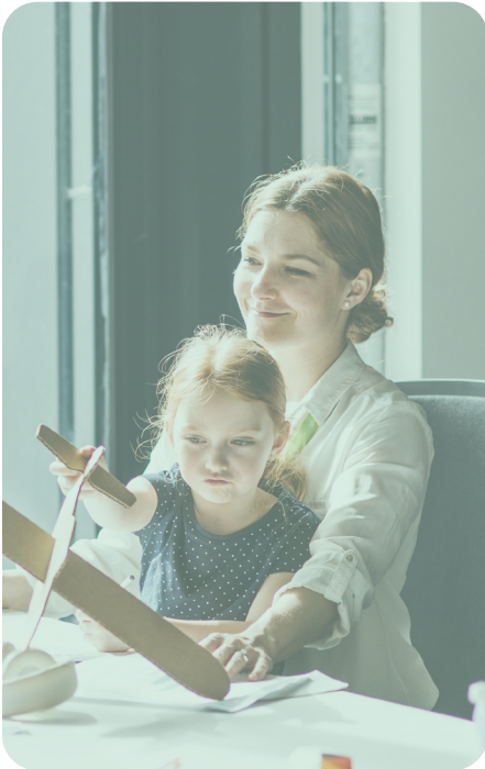
INDIVIDUAL INCORPORATED BUSINESS OWNERS

Whether you're looking for a sole benefit plan or a unique top-up to existing coverage, myHSA provides options to meet all company sizes.