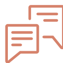
LIVE CHAT – 24/7 SUPPORT