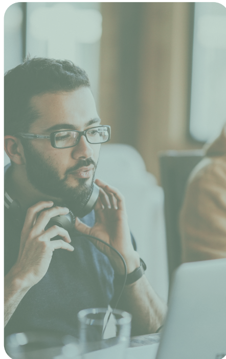
SMALL TO MID-SIZE BUSINESSES (2 - 50 employees)